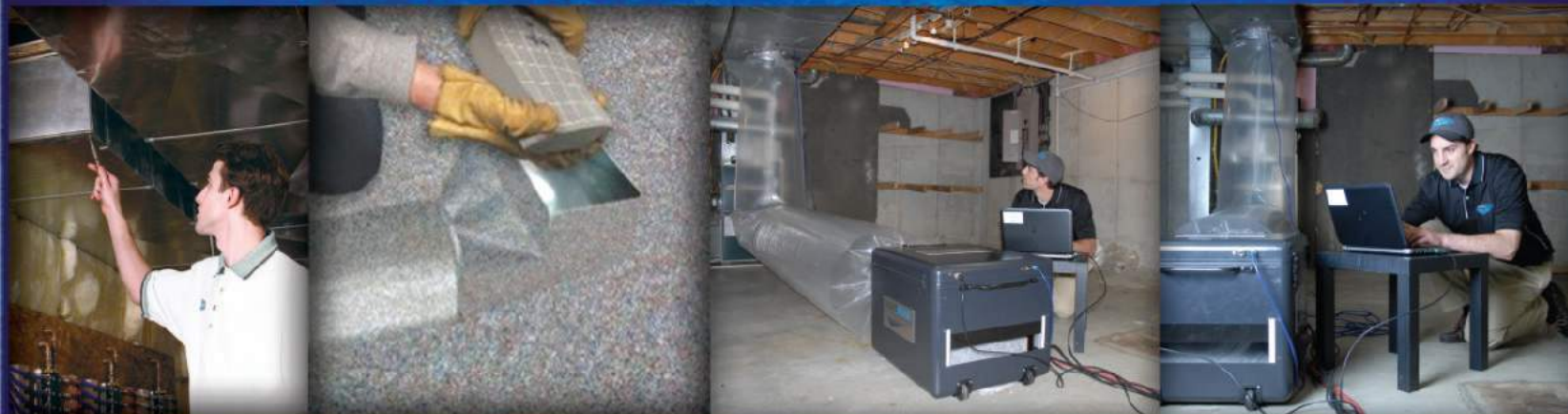
AeroSeal technician conducts initial diagnosis by analyzing airflow